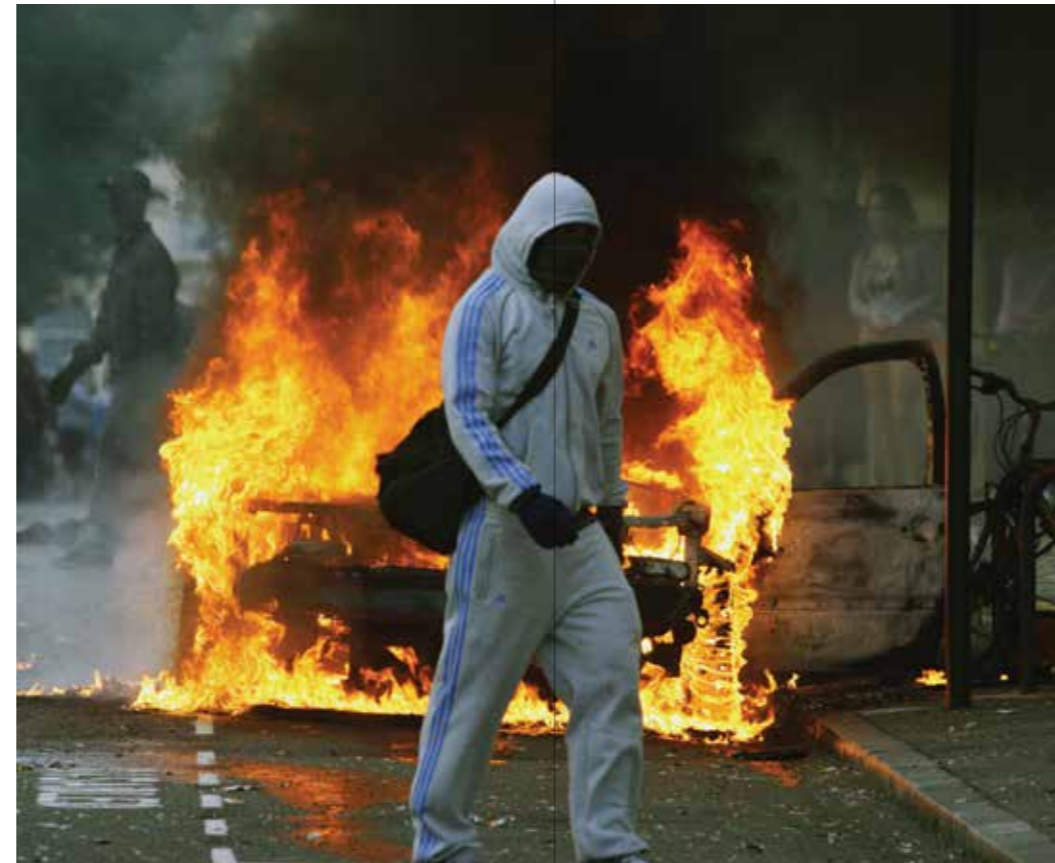
Vulnerability to violence is a universal issue: London suffers rioting and looting in August 2011.

While some countries have been seriously affected by armed conflict, people everywhere face insecurity in their lives. Any goal on peace, justice and governance should look beyond what some Member States refer to as “special situations” and ensure that freedom from fear is promoted in all countries.