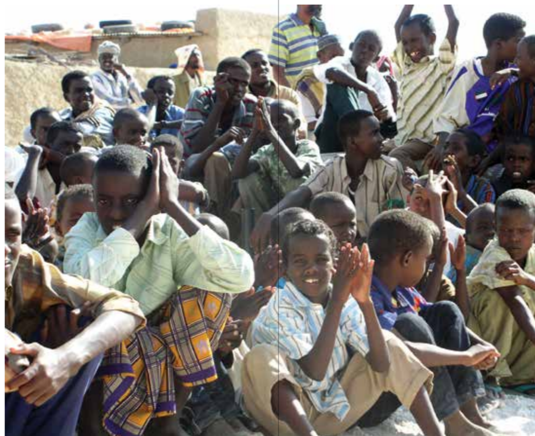
People all around the world see peace as essential to their well being. Young boys in Mogadishu, Somalia.